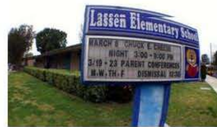
Teacher Removed for "Inappropriate Behavior"